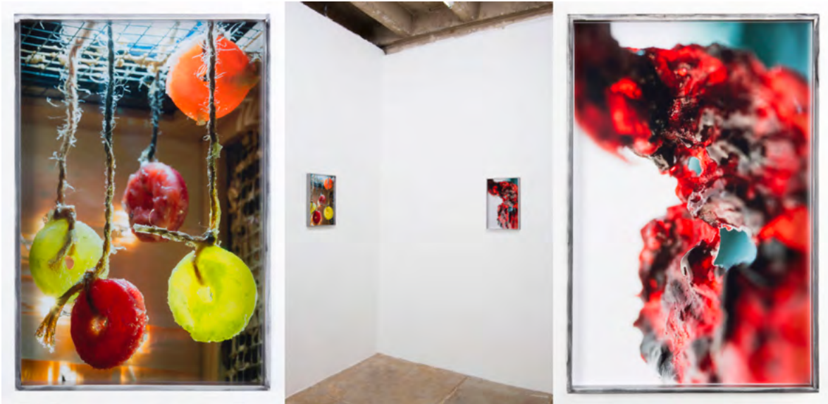
Left to right: Diane Severin Nguyen, Co-dependent exile , 2019. LightJet chromogenic print, artist frame, 15 x 10 in. Installation view, Flesh Before Body , Bad Reputation, Los Angeles, January 26 – March 9, 2019. Pain Portal , 2019. LightJet chromogenic print, artist frame, 15 x 10 in. Courtesy of the artist and Bad Reputation, Los Angeles. Photos: Bad Reputation.

Without being grandiose, I think the most basic question I'm asking in my work is if one can be touched without having to touch. That's what we implicitly demand from images. So when I create a fake wound, I'm also questioning if pain could ever be transmitted in such an excessively symbolic way. Who can feel pain? How is that transmitted? What does it look like? I think there's something lingering in my images in that way... this idea of the capture of a suspended moment. I try to enact these things literally. There's a certain melodrama to it, but the whole point is that I've constructed everything, and the image is supposed to exude that overconstruction. It speaks to the absurdity of such an index.